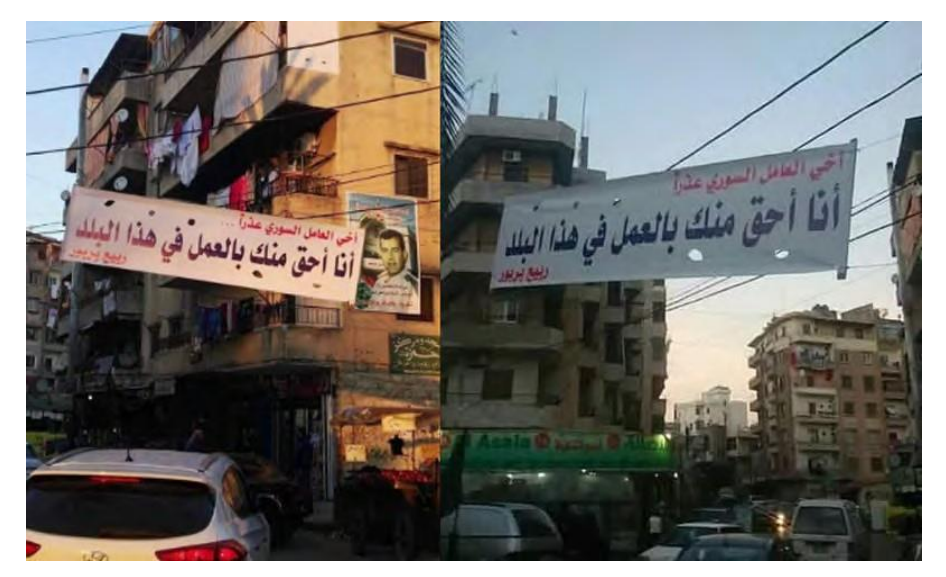
Image 5: As of the end of January 2017, the banner is hung in two different locations in Al Qoubeh-Tripoli. The sign says: "Dear Syrian refugee, I deserve to work in my country more than you do."