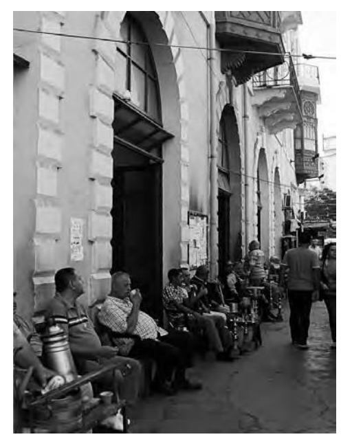
Image 4: Men spending their time outside a coffee shop in Al-Tel, Tripoli

In addition to the residency permits, in mid-2015, the Ministry of Labor began a national campaign aimed at pressuring Lebanese business owners to employ only Lebanese nationals. The Ministry has since formalized a new legal framework that regulates Syrian labor in Lebanon. Syrians can only legally work in three sectors: construction, environment, and agriculture. The inauguration and rise to power of Mr. Mohammad Kabbara, the new Minister of Labor, has strongly influenced public opinion in Tripoli that Lebanese workers should have priority for jobs. The Ministry of Labor recently increased its presence in the city, especially in the downtown areas of Tripoli (Sahet El Nour and El Tal), which are central to commercial activities. The ministry conducts routine spot check visits to ensure that Syrians are not working outside of the three sanctioned sectors and without a work permit. These measures have directly contributed to the closure of dozens of commercial establishments because they were employing Syrians and not observing legal procedures.