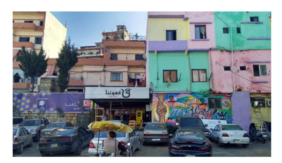
Image 6: Some popular rapid employment initiatives for Tripoli residents include "beautification projects", which include painting the exteriors of buildings, as a means to visually improve the city aesthetics from the destruction of the war.

The implementation of large-scale rapid employment initiatives, which can include the rehabilitation of vulnerable crowded internal neighborhoods, installation of renewable energy alternatives, maintenance and construction of sewage infrastructure networks, as well as green spaces are recommended due to