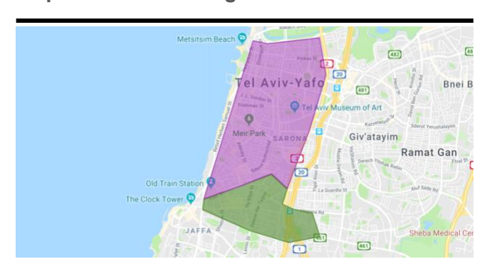
Map 1: Tel Aviv's Neighborhoods

North and Central Tel Aviv in purple, South Tel Aviv in green. This green area includes Levinsky Park and the central bus station, both of which are hubs for newly arrived and settled migrants. Map by authors.