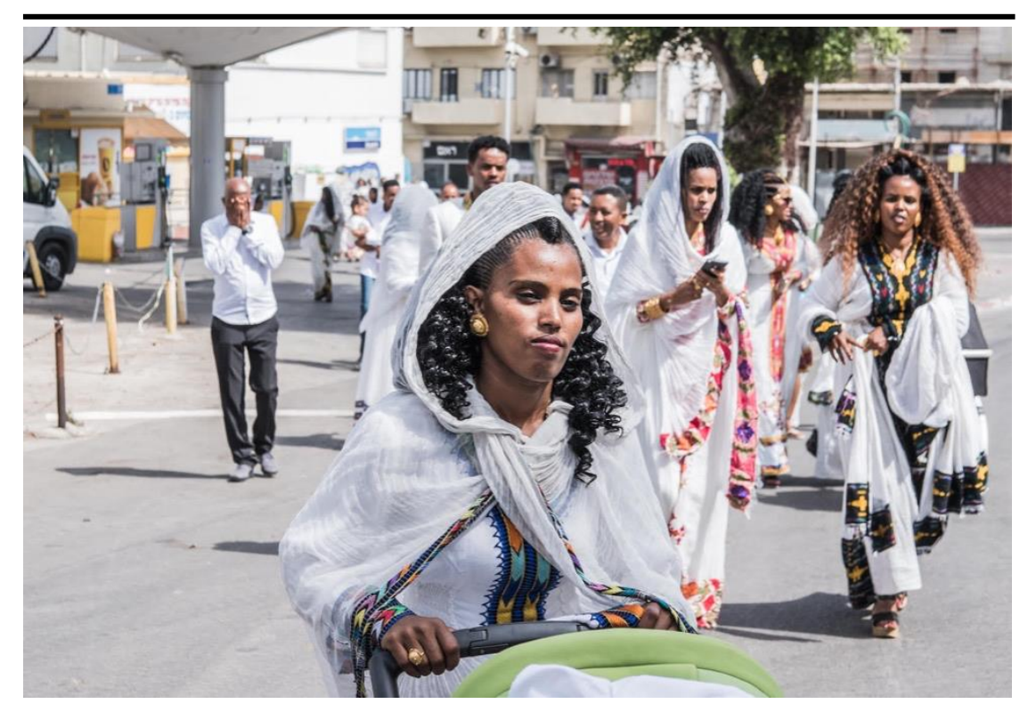
Figure 2: Eritreans in South Tel Aviv

Eritreans on their way to a park after a baptism ceremony in church. South Tel Aviv, 2018.