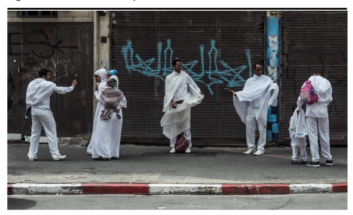
Figure 1: A South Tel Aviv Baptism

Eritreans on their way to a park after a baptism ceremony in church. South Tel Aviv, 2018.