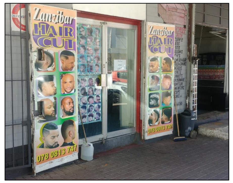
Figure 5: A Congolese salon

Migrants' favorite foods from their countries of origin are sold here.