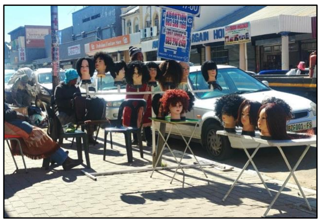
Figure 3: A typical shop owned by migrants