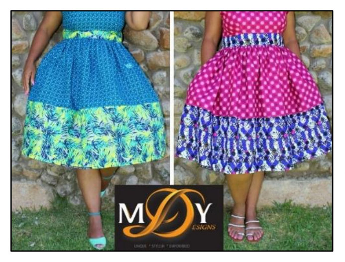
Figure 2: Outfits made from Nigerian and Basotho materials.