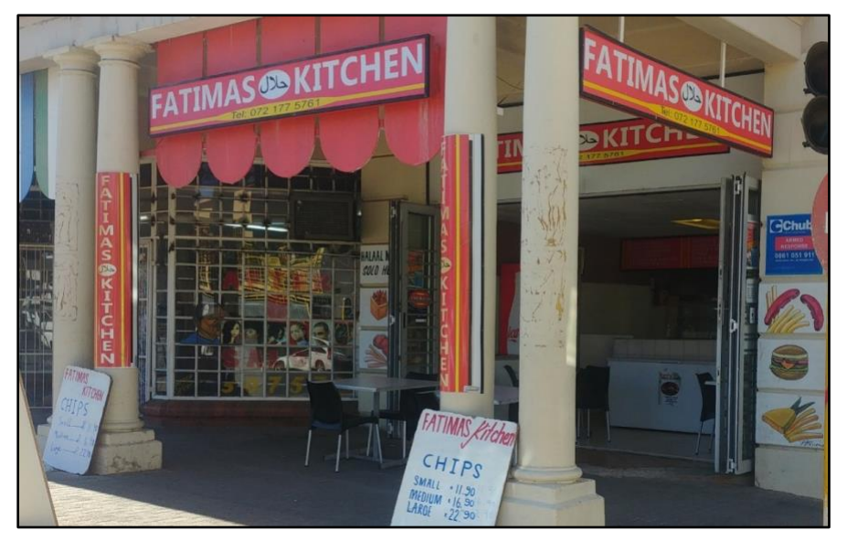
Figure 4: Food Outlet Owned by Migrants

business, a migrant only needs a bakkie <sup>12</sup> and to advertise online. Further, these transportation businesses are not registered, so workers pocket all the proceeds.