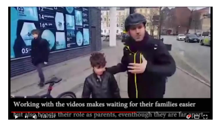
Figure 1 Screenshot of me explaining to my family how people commute on bicycles in Aarhus.

Having been granted asylum, I came to Aarhus by myself first and eventually had the right to apply for family reunification. It was hard to have to wait a long time for my family and to face the challenges alone, while I missed my wife and my daughter. Even though I had to flee Syria to avoid being drafted into the regime's military, sometimes I felt guilty because I left my family in war circumstances while I was safe in Denmark. The time it took for them to be allowed to join me was much longer than I had expected.